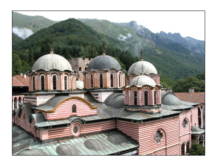
Figure 4. The Rila Monastery, the finest and most famous in Bulgaria.

The Colloquium dinner was organised in one of the folk-restaurants in the vicinity of Blagoevgrad on the Thursday evening. We were treated to traditional delicacies such as a variety of mixed salads and traditional grilled meats served with fried vegetables and potato, and of course, accompanied with generous amounts of Bulgarian red wine and beer. Of the events, unusual for EAC, one can mention the 'horo', a traditional round dance of Bulgaria and Macedonia, in which almost half of the participants were involved (Fig. 3) (but actually, everyone should have been involved). Truly, there were no unhappy people that evening.