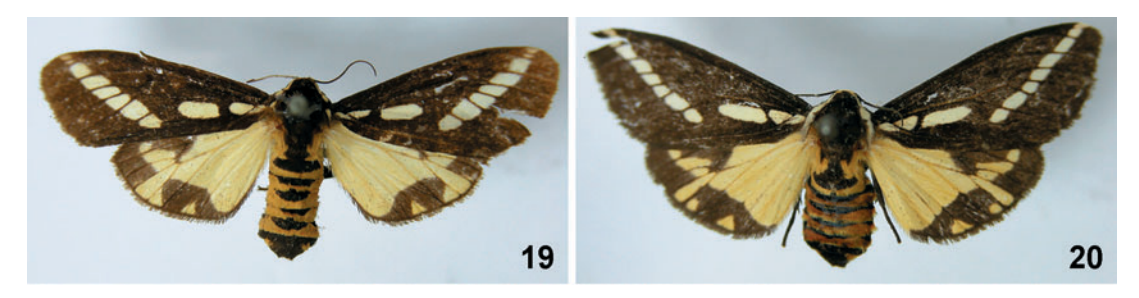
Figs 19-20. Nannoarctia moths from China, . 19. Yunnan, Xishuangbanna; 20. Yangbi.